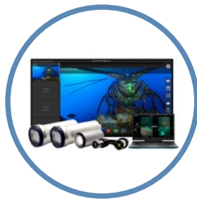
Subsea 4K & HD Video Survey