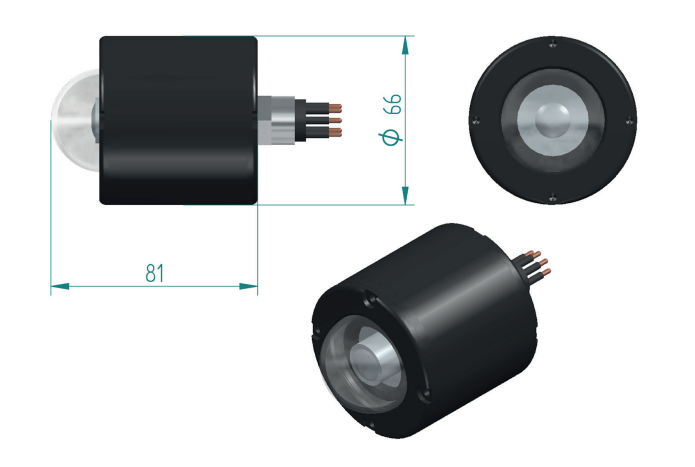
Eagle IP 180° Eagle IP 360°